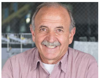
CHAIR, EXECUTIVE COMMITTEE Mayor, Price City